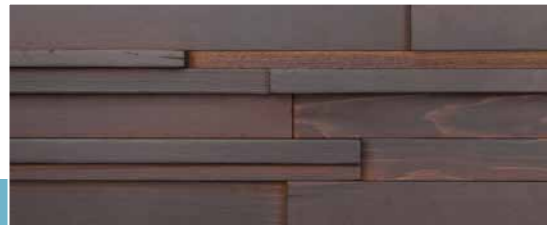
STACK PANEL WENGE