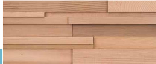
STACK PANEL ORIGINAL

Stack Panel original is our stock-item. As from 70 m 2 we, Premium Panels, are able to lacker the panels in any requested color.