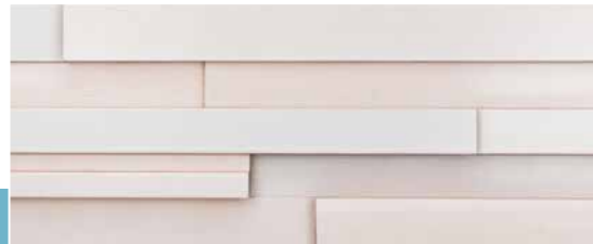
STACK PANEL WHITE WASH