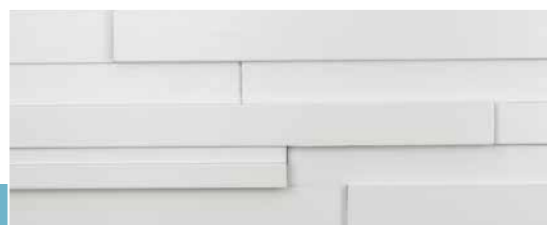
STACK PANEL PLAIN COLOR WHITE*

* Other plain colors available on request